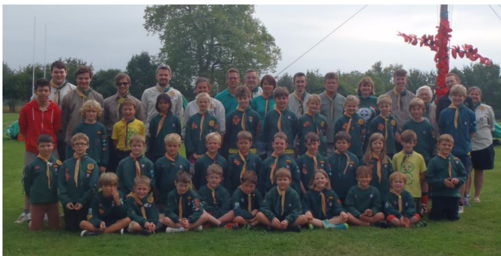
2014 Cub Camp – BCA 5th-7th September 2014