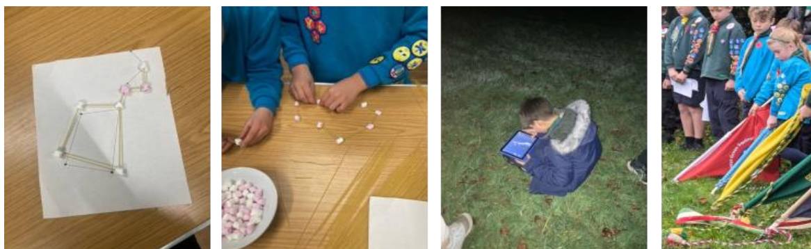
Tic Tac, Winter Hill

The Final week of the month, we finished our space theme doing mini pioneering by making constellations out of marshmallows and spaghetti.