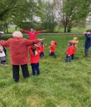
Tic Tac Winter Hill