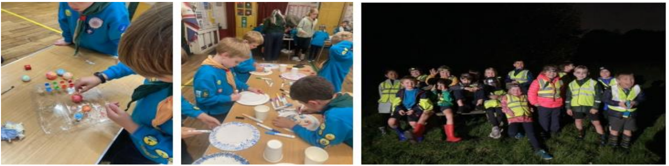
Tic Tac, Winter Hill