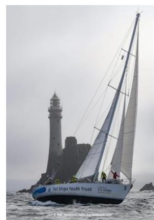
Photo is of challenger 3 during the race.