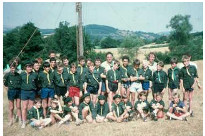
1984 Summer Camp Monmouth