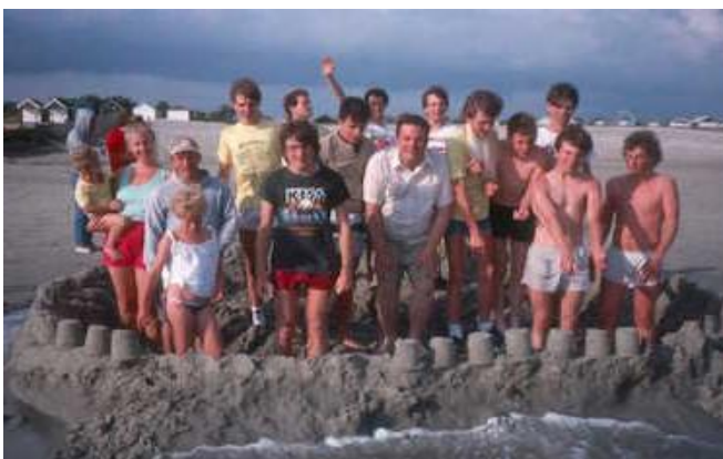
1984 Gryphon (Our Ventures) Trip West Whittering