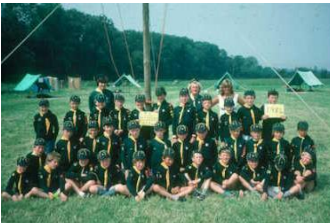
1984 Cub Camp at Hurley