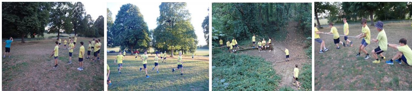
Scout Leader Winter Hill ( Simon Wheeler )

August Summer Holidays - We continued to run meetings during the summer holidays; we have generally had a good attendance with 21 attending the first meeting after camp. Activities included wide games in the woods and team games on the green. Due to the very dry ground and the danger of fire we were unfortunately unable to do the planned cooking in the woods.