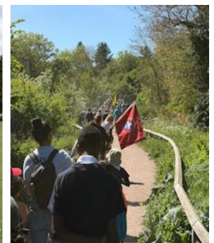
Baloo, Littlewick Green (Erica Hunter)